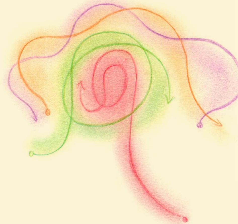
eurythmy form by Rudolf Steiner for week 23 »Stummer Nachtakt« Realisation in colour: Ursula Zimmermann

** Prices are per person per night. Prices for accommodation cannot be guaranteed.