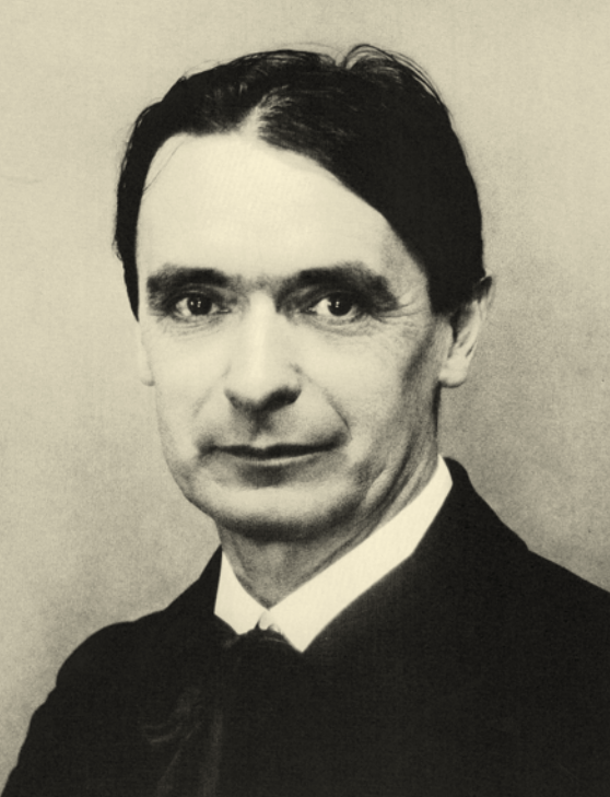
Rudolf Steiner (1915)